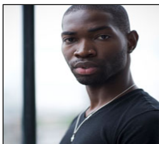
Tarell Alvin McCraney